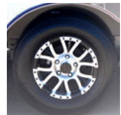
TWO TONE ALUMINUM